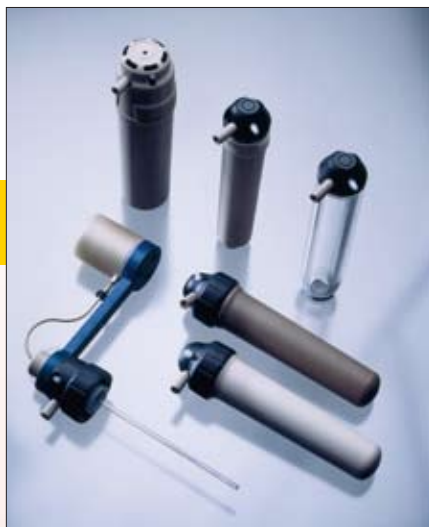
Figure 1. The rugged temperature probe design improves reliability.