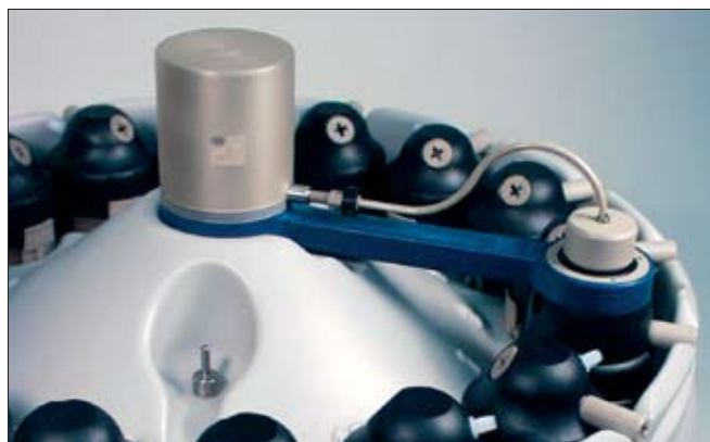
Figure 3a. The 16-position rotor maximizes productivity.

The pressure and temperature data are sent to the oven via optical transmission. No electrical or mechanical connections are required. Optionally, all 16 vessels can be temperature-controlled by means of the external IR sensor.