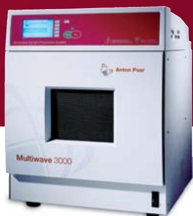
Multiwave 3000 Sample preparation system