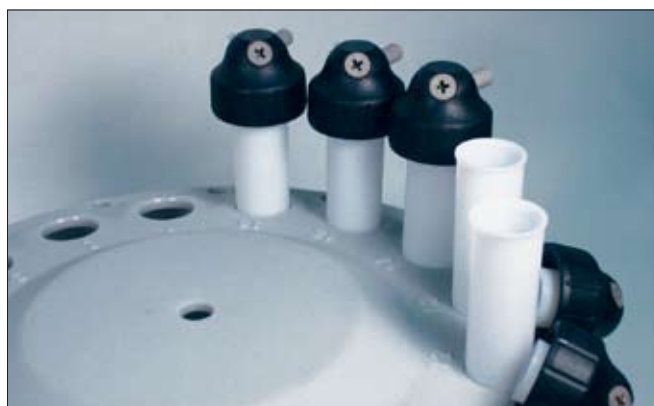
Figure 3b. The 16-position rotor cover can also be used as a vessel rack.