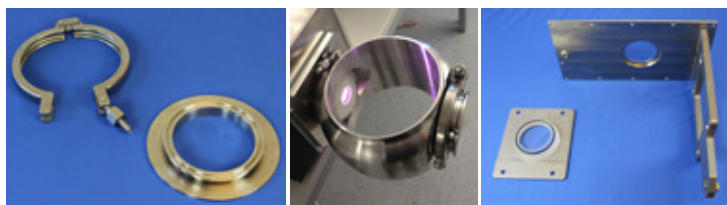
1. Mounting Flange

3. Mounting Panel is a flexible and easy-to-use mounting option for conveyors and other flat surfaces.