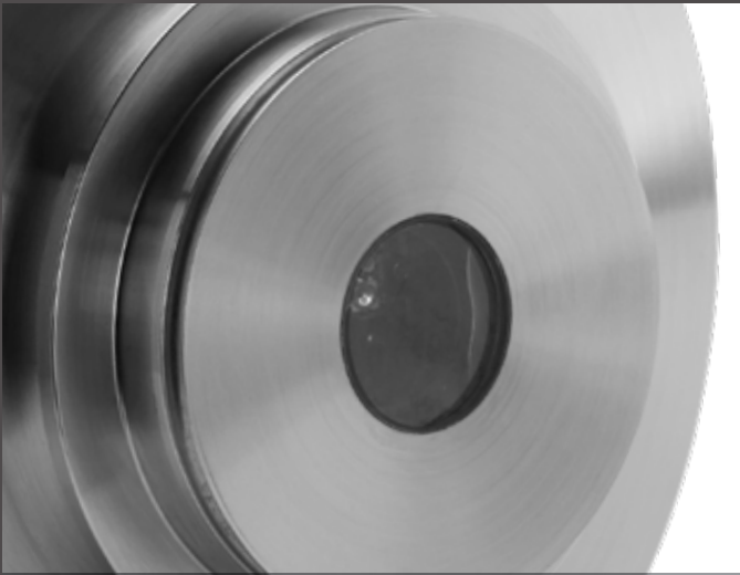
MODERN NIR INSTRUMENT COMBINED WITH CAMERA