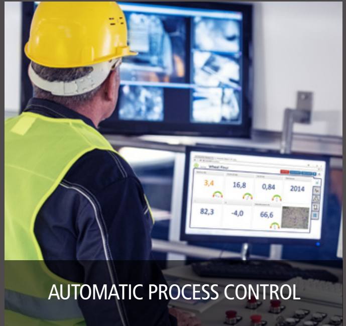
AUTOMATIC PROCESS CONTROL