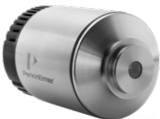
DA 7350 In-line NIR Instrument