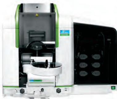
Figure 1. PerkinElmer PinAAcle 900T atomic absorption spectrophotometer equipped with AS 900 graphite furnace autosampler.

The measurements were performed using the PerkinElmer PinAAcle™ 900T atomic absorption spectrophotometer (PerkinElmer, Inc., Shelton, CT, USA) (Figure 1) equipped with an AS 900 graphite furnace autosampler and WinLab32™ for AA software running under Microsoft® Windows™ 7 operating system.