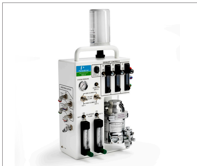
Figure 1. The RAS-4 provides four anesthesia ports, to deliver isoflurane to two imaging systems, the induction chamber and one additional accessory simultaneously while providing dedicated scavenging of anesthesia, reducing exposure to the user.