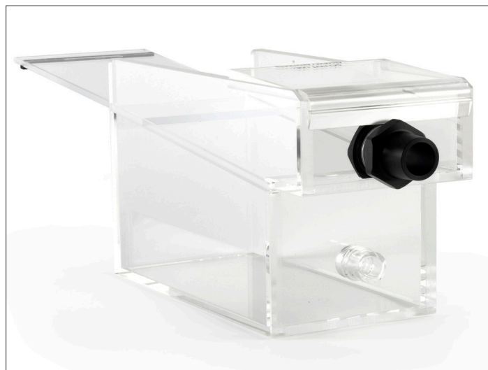
Figure 2. The RAS-4 comes with an oversized, vented induction chamber that will accommodate five mice or two rats.