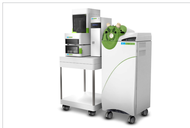
Figure 4. The QSight LX50 UHPLC integrates with all QSight MS/MS models.

The PerkinElmer QSight LX50 UHPLC integrates seamlessly with both the QSight LC/MS/MS and its Simplicity™ 3Q software to deliver the highest levels of performance from sample handling right through final results and reporting. The QSight LX50 UHPLC delivers the perfect blend of performance and reliability you need to optimize your workflow and achieve higher levels of productivity.