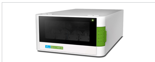
Figure 2. QSight LX50 Solvent Delivery Module.