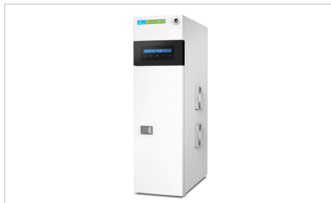
Figure 3. QSight LX50 Column Stability Module.

An often overlooked and underappreciated component of an UHPLC system is its column temperature control module (frequently referred to as a column oven). Maintaining a precise and consistent temperature for both the column and mobile phases results in highly reproducible retention times, while having the ability to set a specific temperature is a great tool to enhance selectivity, improve peak shape and reduce analysis time. Finally, the ability to run at elevated temperatures reduces column back pressure significantly – which allows higher solvent flow rates even with narrower columns and smaller particles. The QSight LX50 Column Stability Module delivers precise and consistent temperature control while offering a spacious multi-column compartment for quick and easy access. Also, the QSight LX50 incorporates a solvent pre-heater mechanism that effectively regulates solvent temperature before it reaches the column to ensure maximum stability and reproducibility from run to run.