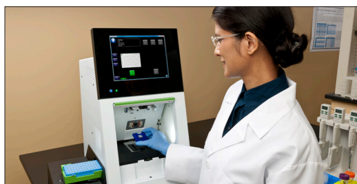
Figure 1. The LabChip GX Touch platform offers rapid RNA quantification.

A single sipper microfluidic chips is used to aspirate RNA samples directly from 96- or 384-well plates. The microfluidics chip technology automatically mixes in an intercalating dye, electrophoretically separates and analyzes the RNA sample. The instrument optics detect the laser-induced fluorescent signal. System software automatically analyzes the data and determines fragment size and concentration using ladder and marker calibration standards. Digital data results are immediately available for review or reporting in virtual gel, electropherogram graph or table summary form.