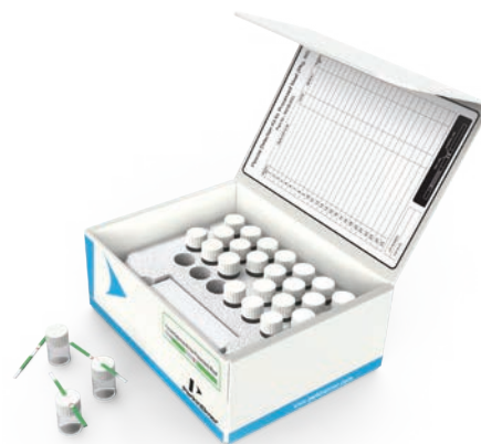
Table 1. Porcine Detection Kits Characteristics

Table 1 describes the characteristics of the kits in more detail. The kit is a screening kit so a “positive” or “negative” result is the goal. The kit does not provide a numerical concentration of the pork contamination that might be observed. A test using an alternative technology may be used as a confirmation when a positive test result is obtained.