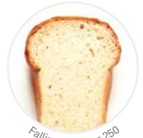
Falling Number 250