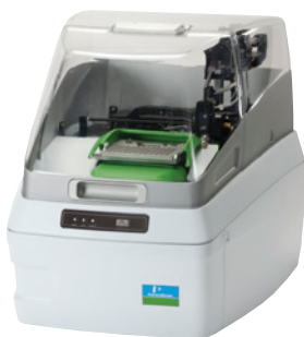
Figure 1. DSC 8500

In designed formulations for lyophilized drugs, it is important to know the collapse temperature of the cake. If the collapse temperature is exceeded, the cake will collapse and the batch will be ruined. The collapse temperature is often associated with the T g ' of the frozen material and measuring this transition is the best way to approximate it. In addition, it is useful to know the amount of non-frozen water, which can be estimated as the enthalpy of melting ( \Delta H ). Both of these necessary values may be obtained with PerkinElmer's Diamond DSC (Figure 1).