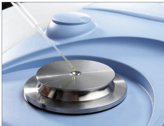
Figure 1. The quality control method according to the international ASTM D7371-07 standard requires an Attenuated Total Reflectance (ATR) accessory as shown here on the PerkinElmer instrument.

With proven leadership in product innovation, including the introduction of the first commercial instruments in Infrared Spectroscopy (IR), Gas Chromatography (GC), and Graphite Furnace Atomic Absorption (GFAA) Spectroscopy, PerkinElmer continues to make advances in analytical solutions, including EcoAnalytix complete testing systems for the environment, food safety and renewable energy industries. Combining instruments, standard operating procedures, training and support, EcoAnalytix analyzers are designed to help these industries meet regulatory requirements.