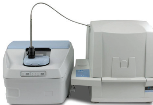
DSC-Raman from PerkinElmer.

PerkinElmer, Inc. 940 Winter Street Waltham, MA 02451 USA P: (800) 762-4000 or (+1) 203-925-4602 www.perkinelmer.com