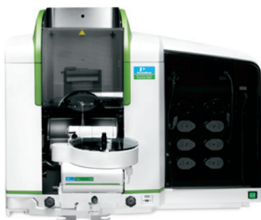
Figure 1. PerkinElmer PinAAcle 900T atomic absorption spectrophotometer equipped with AS 900 graphite furnace autosampler.

The measurements were performed using the PerkinElmer PinAAcle™ 900T atomic absorption spectrophotometer (PerkinElmer, Inc., Shelton, CT, USA) (Figure 1) equipped with an AS 900 graphite furnace autosampler and WinLab32™ for AA software running under Microsoft® Windows™ 7 operating system.