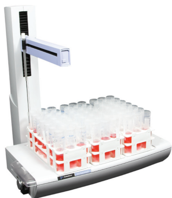
Figure 3. PerkinElmer S10 autosampler.

The PerkinElmer S10 Autosampler (Figure 3) was used for high throughput and automated analysis. The autosampler automates standard and sample introduction for instrument calibration and sample analysis, as well as quality control checks.