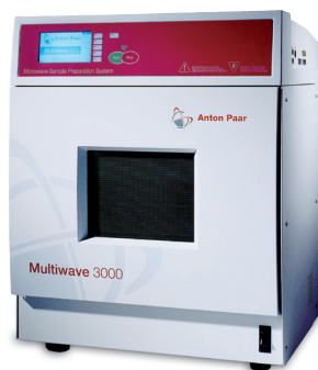
Figure 4. Multiwave™ 3000 Microwave Digestion System.

An Anton Paar® Multiwave™ 3000 (Austria – shown in Figure 4) was used for microwave-assisted digestion of soil samples (i.e. U.S. EPA method 3052). This is an industrial-type oven which can be equipped with various accessories to optimize the sample digestion. In this case, the samples were digested in the rotor 8XF100 comprising of eight 100 mL high-pressure vessels made of PTFE-TFM in their respective protective ceramic jackets. These vessels have a working pressure of 60 bar (870 psi) and can operate at temperatures up to 260 °C. All vessel temperatures were monitored with the IR temperature sensor. Use of the Multiwave™ 3000 greatly reduces the amount of time required for sample preparation and the closed-vessel digestion avoids loss of volatile analytes to ensure accurate analysis.