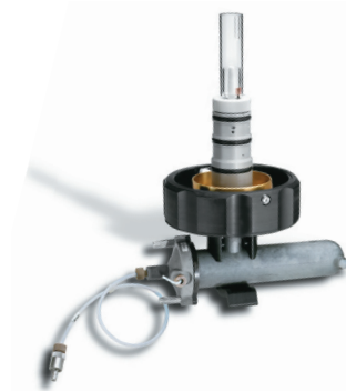
Figure 2. HF-resistant sample introduction unit.

The sample introduction unit employed included a Ryton ® Scott spray chamber and the GemTip ™ Cross Flow Nebulizer (Figure 2). The Ryton ® Scott spray chamber is made from corrosion resistant Ryton ® , which is inert to most mineral acids including HF (used in this study). GemTip cross flow nebulizers are excellent general-purpose nebulizers, for the analysis of strong mineral acids, and can handle up to 5% dissolved solids (for higher dissolved solids, the GemCone ™ high dissolved solids nebulizer, which can handle up to 20% dissolved solids, is recommended. This requires an end cap for use with the Ryton ® Scott spray chamber). The torch position is optimized at the best position for improved performance in the presence of high dissolved solids and also to minimize injector clogging.