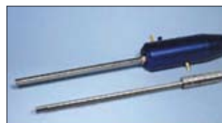
Raman Probe Max with and without optional purge enclosure.