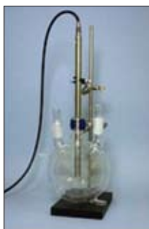
Raman Probe Long with immersion sleeve in place.

The PerkinElmer fiber optic probes offer research grade performance and are maintenance free. Standard fiber cable lengths are 5 m. Longer cables, up to 100 m, are available upon request. All probes are stainless steel 316, but are available in chemical resistant Hastelloy® C. Spectral range can be modified in standard and triggered fiber optic probe to have a cut-off down to 120\text{ cm}^{-1} .