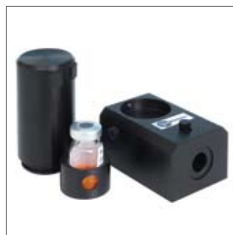
Vials and powder kit – For use in a class 1 environment