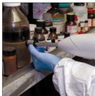
Adjustable working distance contact tip