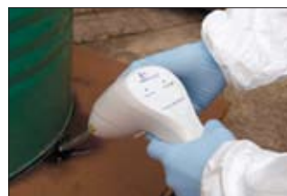
Triggered Raman probe.