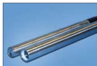
Raman Probe with optional immersion sleeve.