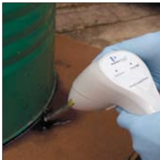
Short immersion sleeve – stainless steel 316 and sapphire window